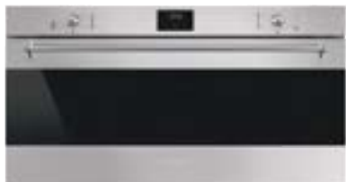
900mm Built-In Oven