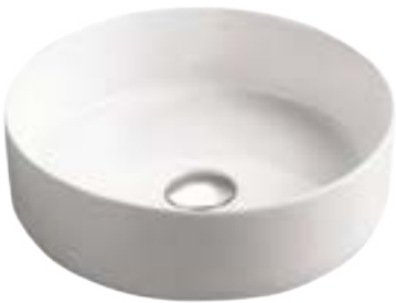
Benchmount vanity basin