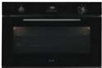
900mm Built-In Oven