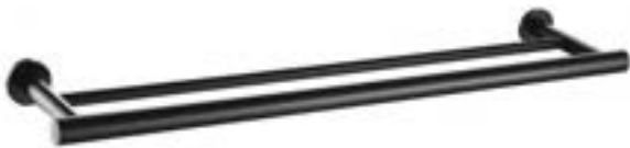
Double towel rail