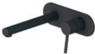
Wall mounted mixer kit