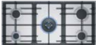
900mm Built-In Gas Cooktop