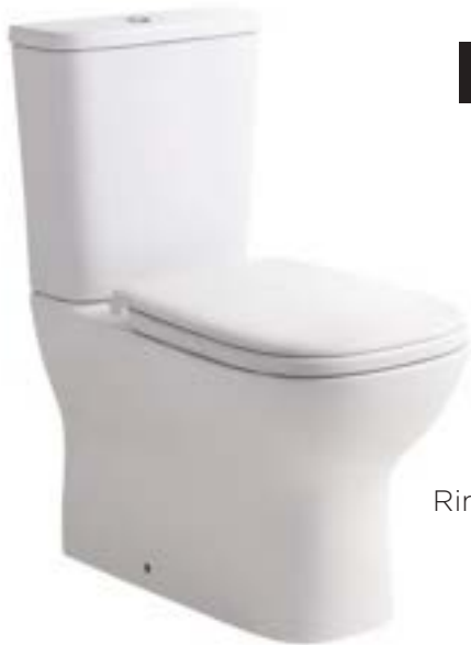
Rimless back to wall toilet suite