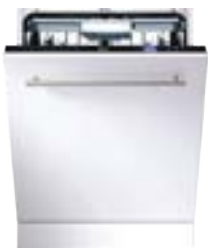
Fully Integrated Dishwasher