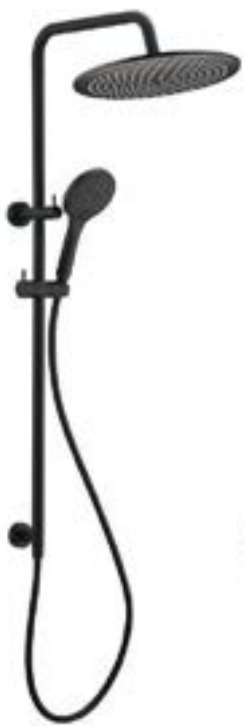
Twin rail shower kit (ensuite only)