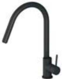
Premium pull out gooseneck sink mixer (Available in 4 colours as standard)