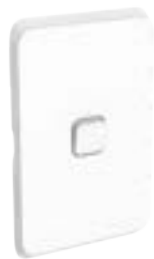
Clipsal Iconic slimline (White)