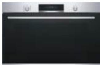
900mm Built-In Oven