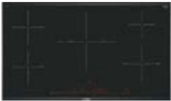
900mm Built-In Induction Cooktop