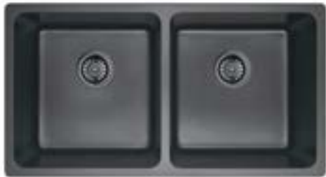
Premium double bowl undermount sink

SPLASHBACK Ceramic tiled splashback included.