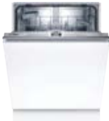
Fully Integrated Dishwasher