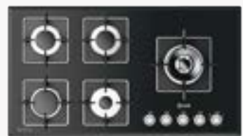
900mm Built-In Gas Cooktop