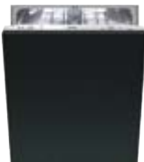
Fully Integrated Dishwasher