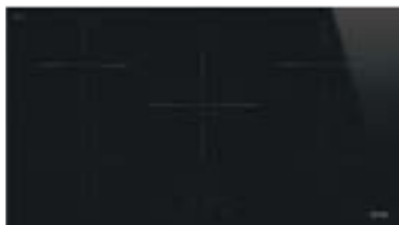
900mm Built-In Induction Cooktop