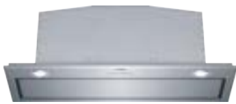
900mm Undermount Rangehood