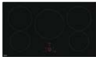
900mm Built-In Induction Cooktop