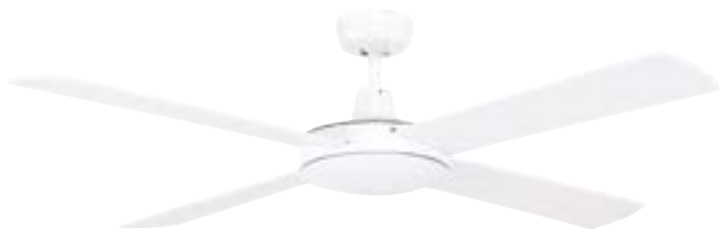
Ceiling Fan (White)