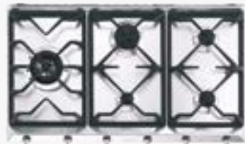
900mm Built-In Gas Cooktop