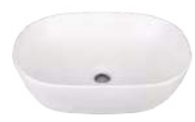
Benchmark vanity basin