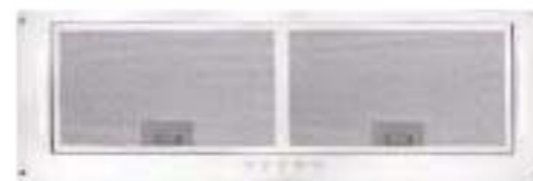
900mm Undermount Rangehood