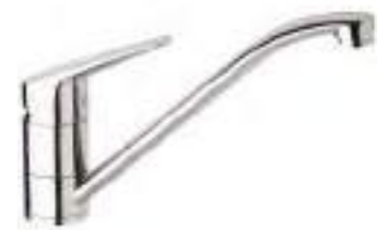
Laundry sink mixer in chrome