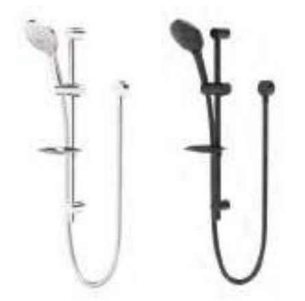
Single rail shower