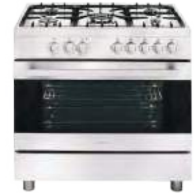
900mm Freestanding Gas Cooktop