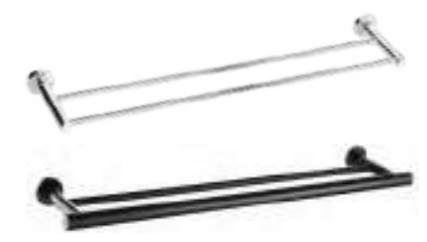
Double towel rail