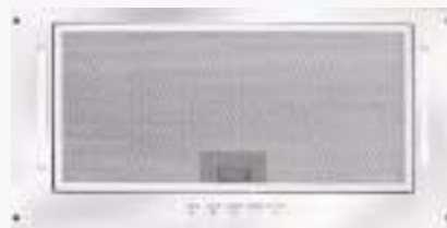
600mm Undermount Rangehood