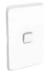
Clipsal Iconic slimline (White)