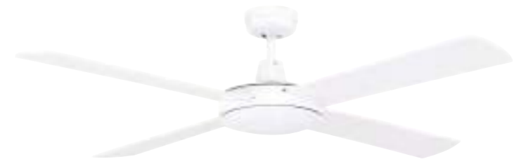
Ceiling Fan (White)