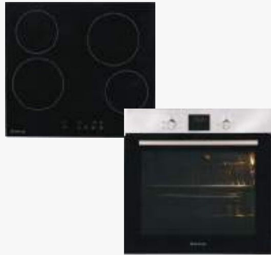
600mm Built-In Oven & Electric Ceramic Cooktop