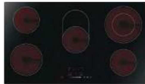
900mm Built-In Oven & Electric Ceramic Cooktop