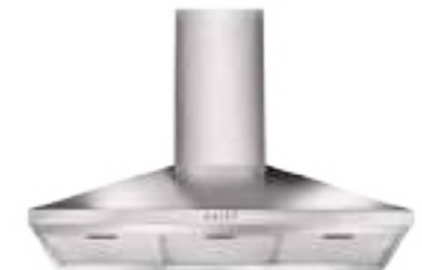
900mm Canopy Rangehood