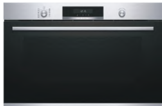
900mm Built-In Oven