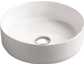
Benchmount vanity basin