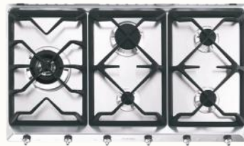
900mm Built-In Gas Cooktop