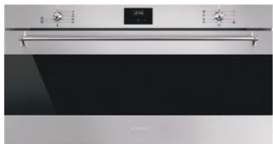
900mm Built-In Oven