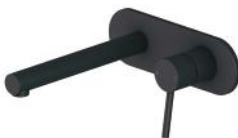
Wall mounted mixer kit