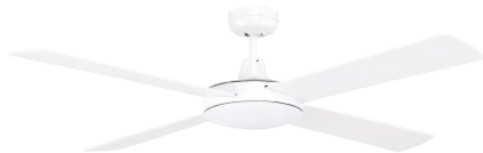
Ceiling Fan (White)

Ceiling fans to living, dining, bedrooms and alfresco.