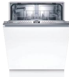
Fully Integrated Dishwasher