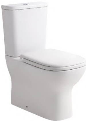
Rimless back to wall toilet suite