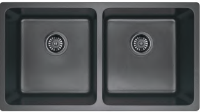
Premium double bowl undermount sink