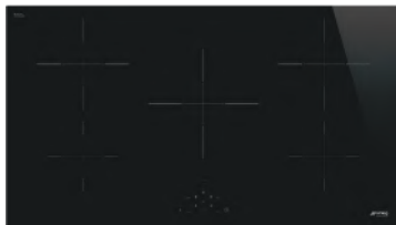
900mm Built-In Induction Cooktop