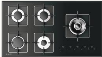
900mm Built-In Gas Cooktop