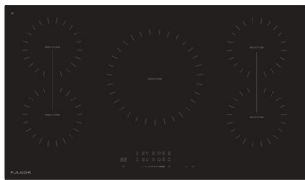
900mm Built-In Induction Cooktop