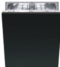
Fully Integrated Dishwasher