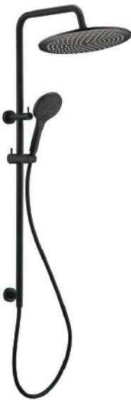
Twin rail shower kit (ensuite only)