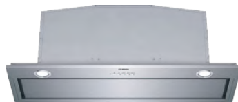
900mm Undermount Rangehood