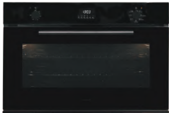
900mm Built-In Oven