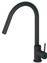
Premium pull out gooseneck sink mixer (Available in 4 colours as standard)