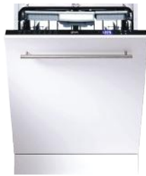
Fully Integrated Dishwasher